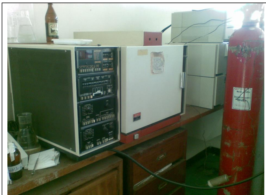
Figure 1: Alcohol Analyser Machine at the Government Chemist

Procedure: 10 Microliters of the sample were mixed with 250 ml of Internal standard (propanol) of known concentration. 1-2 microliter of the mixture was then injected into the gas chromatograph. Calculation; since the molecular weight of ethanol, Methanol and propanol are different; there was clear separation from the resultant Chromatograph. The peak height ratio (or peak area) of the Unknown to that of the internal standard, n -propanol, was done and was compared with the ratio obtained for the corresponding calibrators. The concentration of alcohol was given as g/L.